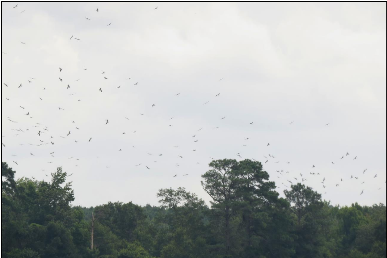
Over 160 Kites, mostly Swallow-Tailed