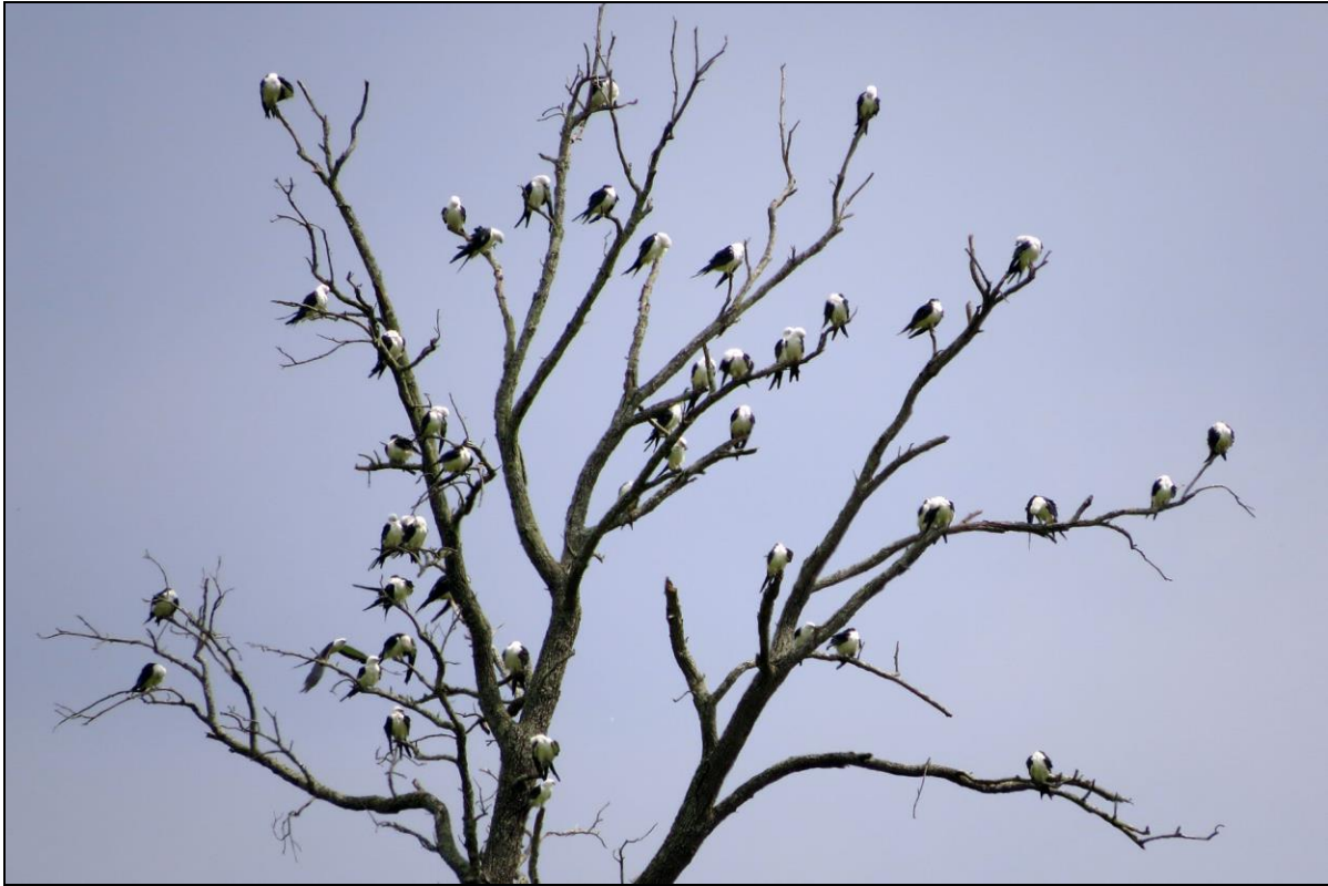
47 Swallow-tailed Kites